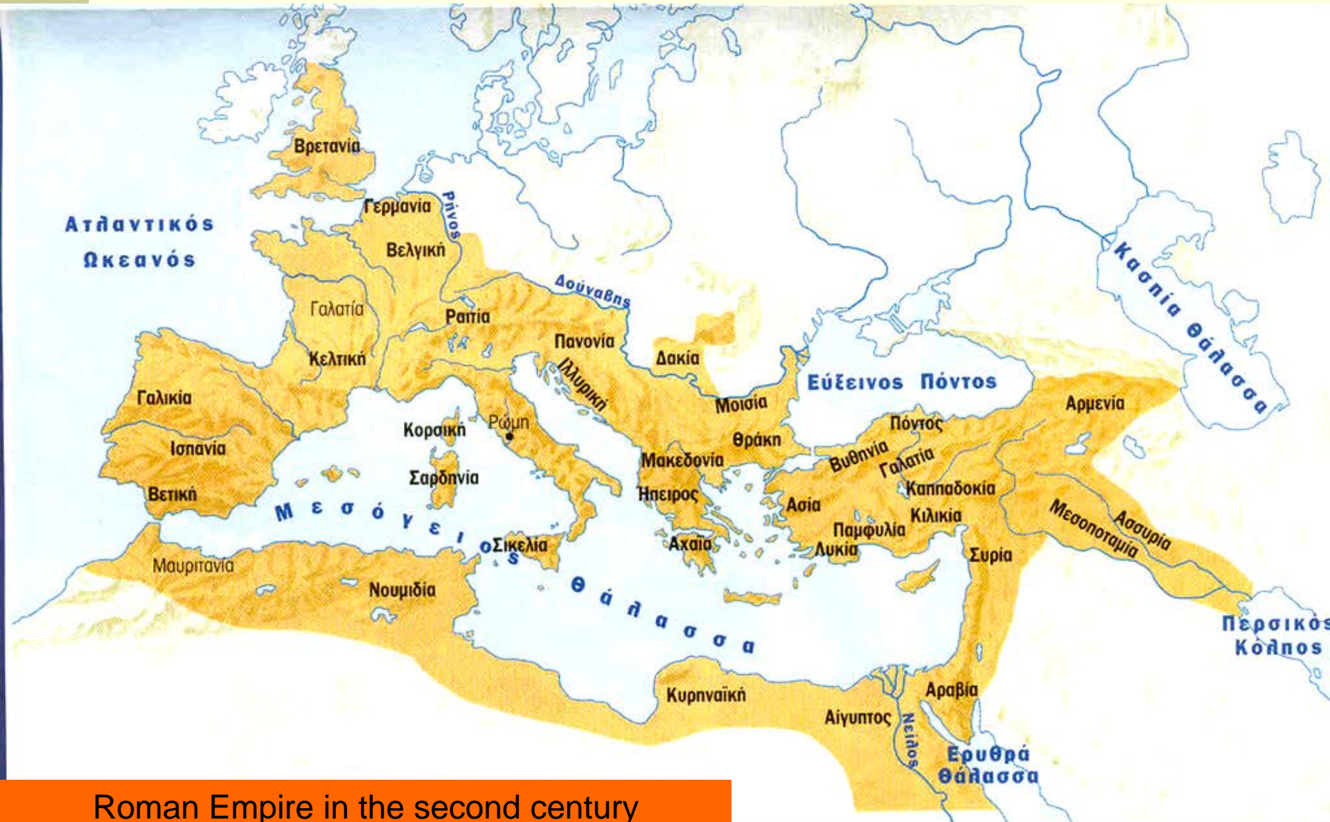
Roman Empire in the second century